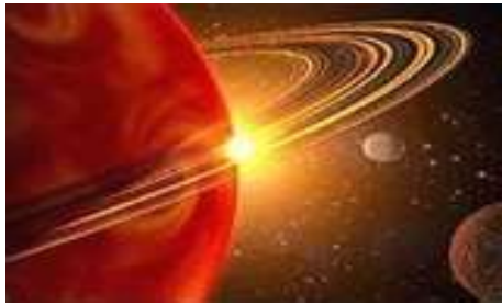
Jack Parson Babalon Working

A brief text entitled The Book of Babalon, or Liber 49 , was written by Jack