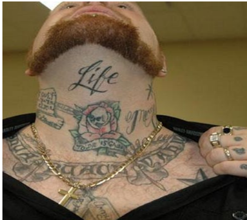
TODD BENTLEY'S TATTOOS

http://healtheland.wordpress.com/2009/05/21/emma-the-angel-at-the-4-0clock-show-the-short-clip-is-classic-to-show-up-canadian-revivalist-todd-bentley-for-exactly-what-he-is-a-liar-and-cheat-besides-a-thief/