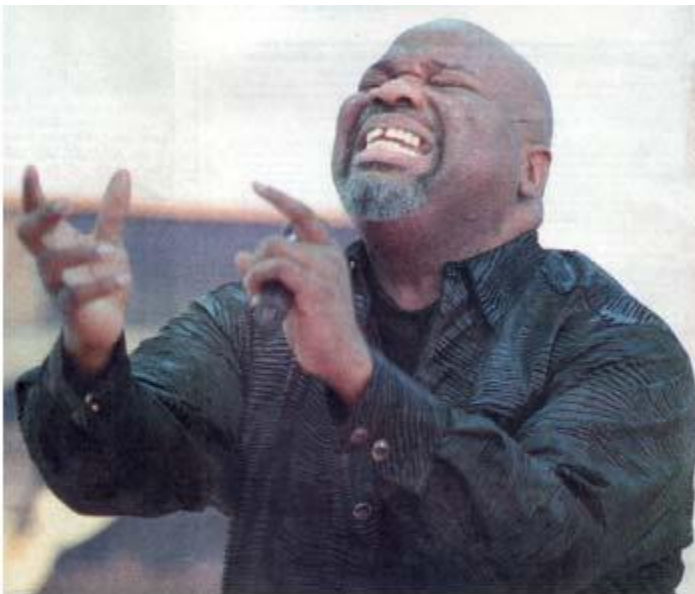
T.D. Jakes knows how to grab the faithful flocking to his 8,200-seat church, not to mention the millions more who watch his cable show, read his books, buy his tapes and attend his plays.

Seasons of Repentance http://www.miracleinternetchurch.com/internet-church-videos/seasons-of-repentance