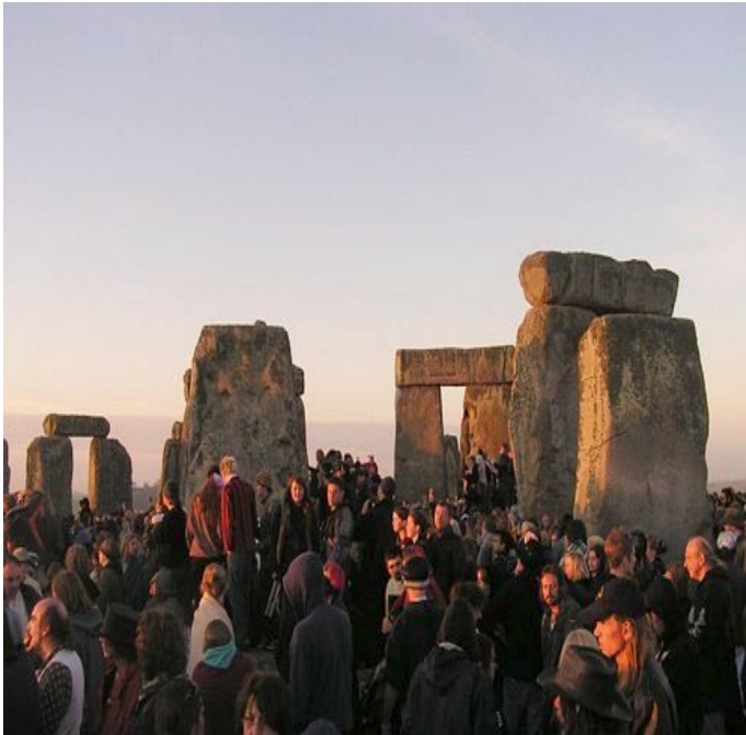
Stonehenge is a prehistoric monument located in the English county of Wiltshire ,

The occult calendar is comprised of four periods of 13 weeks each. We list the Spring Equinox period for you, iii