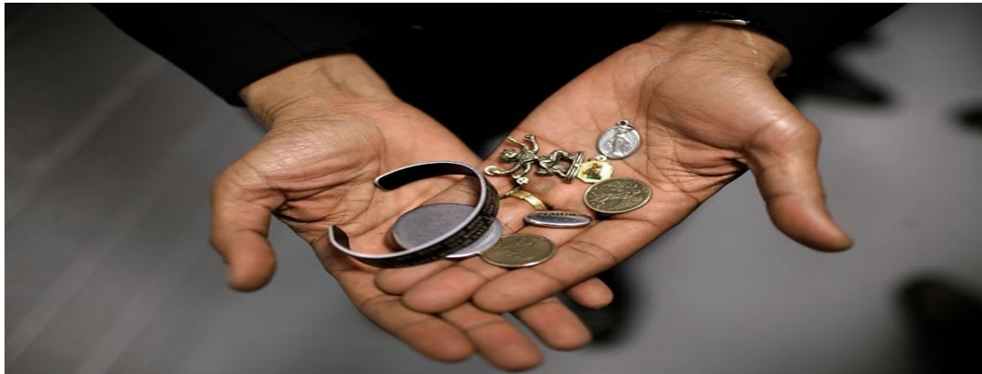
SHAME ON YOU CHURCH ~ THIS CAN DEFEAT YOU?

The group decided to order the idol after they read a magazine report saying that Mr. Obama