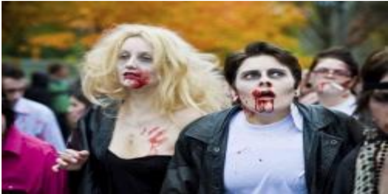
A couple dressed as zombies - Danny Zucco and Sandy Olsson from the movie Grease walking in the annual Toronto Zombie Walk.

We've all seen at least one movie about flesh-eating zombies taking over (my personal favorite is Resident Evil ), but where do zombies come from and why do they love eating brains so much? The word zombie comes from Haitian and New Orleans voodoo origins. Although its meaning has changed slightly over the years, it refers to a human corpse mysteriously reanimated to serve the undead. Through ancient voodoo and folk-lore traditions, shows like the Walking Dead were born.