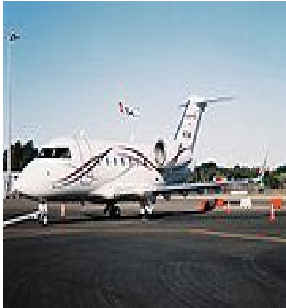
Joyce Meyer's 30,000 golden toilet set jet

Joyce Meyer used to travel in this Canadair Challenger 600S ; seen here in Sydney, Australia when she was a 'special guest' at the Hillsong Conference in July 2005. It has since been replaced by a Gulfstream IV . 1