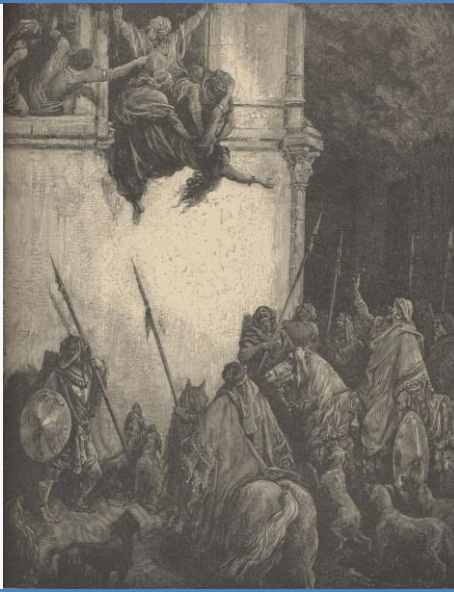
DEATH OF JEZEBEL

And when Jehu was come to Jezreel, Jezebel heard of it; and she painted her face, and tired her head, and looked out at a window. And as Jehu entered in at the gate, she said, Had Zimri peace, who slew his master?