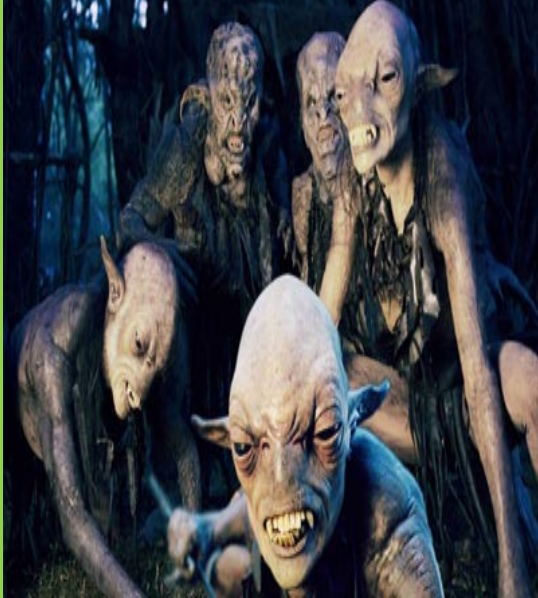
PARANORMAL MYSTICAL WITCHCRAFT