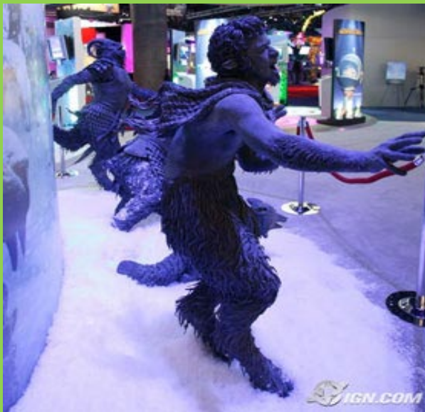
Captured the Imaginations

life. Also, his son's lost their positions in God's scheme for the nation and their lives.