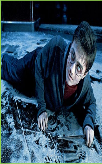
Harry Potter, the Wizard

Movies, The Lord of the Rings. The record shows that very important Christian leadership jumped on the bandwagon with powerful endorsements of these magical-witchcraft films.