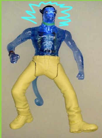
McDonald's Happy Meal Toy -- Jake Sully Avatar JAKE SULLY TOY HEAD LIGHTS UP (ARTISTIC EMPHASIS ADDED).

http://www.robotroom.com/Inside-Avatar-McDonalds-Toy.html