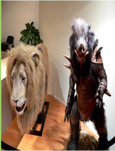
Idols for Children

idol may be defined as the image of a god, or any other material symbol which is the object of worship.