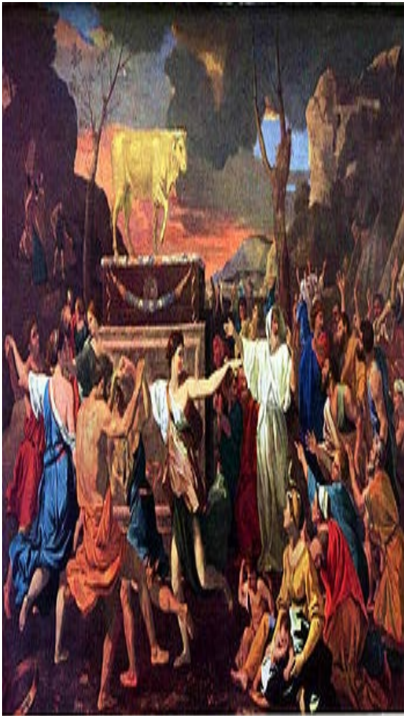
"The Adoration of the Golden Calf " by Nicolas Poussin

“The graven images of their gods shall ye burn with fire, thou shalt not desire the silver or gold that is on them, nor take it unto thee, lest thou be snared therein, for it is an abomination to the Lord thy God,” (Deut. 7:25).