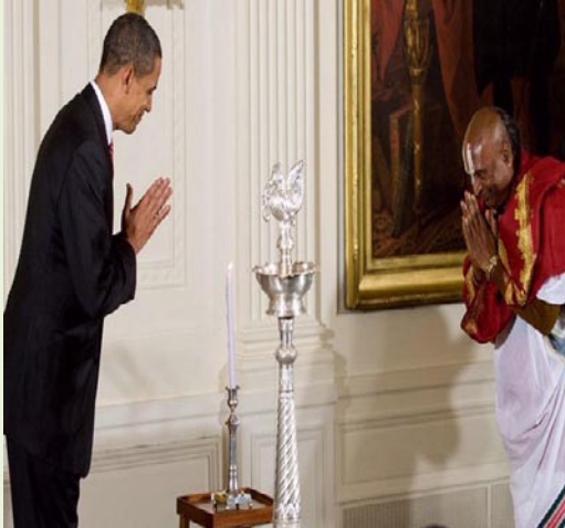
"PRESIDENT OBAMA BOWS WORSHIP CHICKEN GOD WITH HINDU PRIEST

strange person that no one knows who he is except for the lies he tells. He no longer considers America a "Christian Nation."