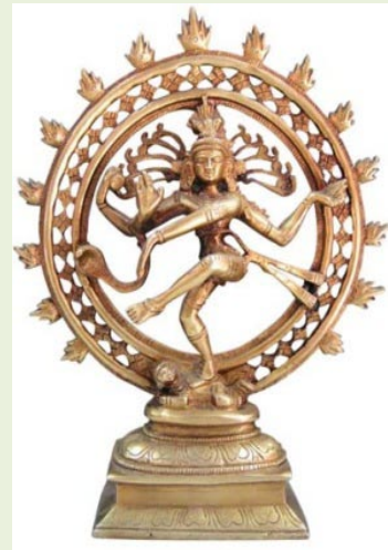
OBAMA as SHIVA the DESTROYER!!!! Obama/Cover of Newsweek...Shiva/Cern Statue! Spot any similarities!